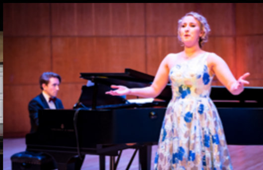
Limerick Classical Concert Series

Front Cover: A Lot Like Christmas Main Photo: Rising Stars 2022