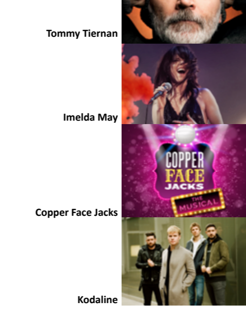
Tommy Tiernan Imelda May Copper Face Jacks Kodaline

As a registered charity, University Concert Hall's work aims to: Develop an accessible concert programme of national and international standing. Develop culture and entertainment in the region, helping to contribute to the social and cultural life of Limerick and the surrounding Mid-west region. Provide a platform to showcase community arts entities including many Limerick operatic and oratorio choirs, youth choirs, local orchestras, musical theatre companies as well as stage and dance schools.