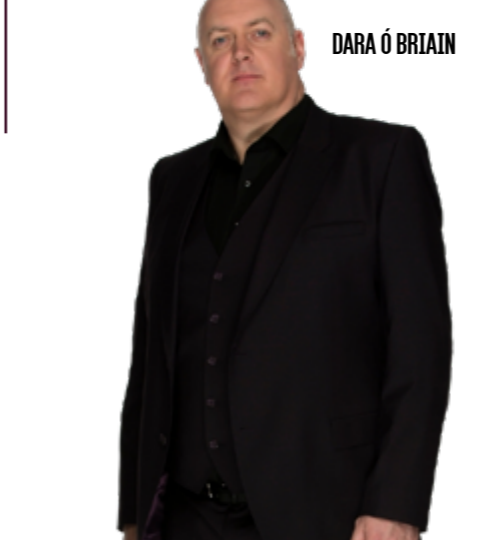
DARA Ó BRIAIN

“Great night and atmosphere. Staff were lovely, very friendly and helpful.” Google Review