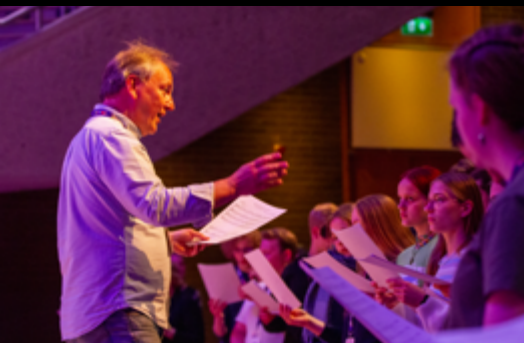
Limerick Sings Workshop