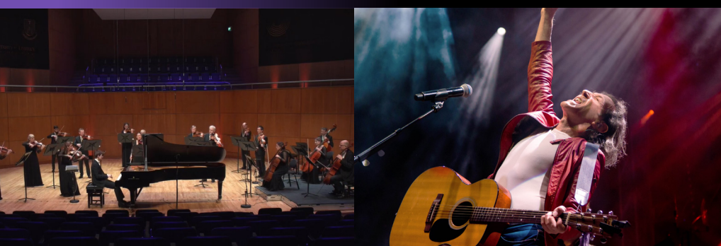
A Viennese Strauss Gala